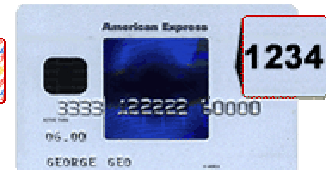
front of credit card